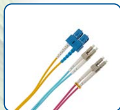
patch cords & pigtails