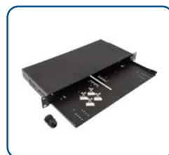
fibre patch panels